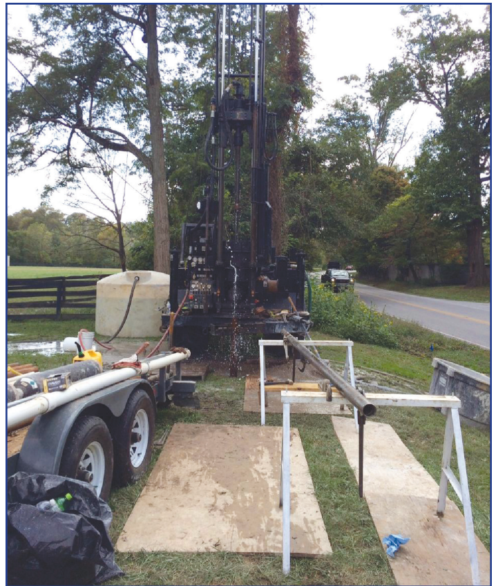
A newly drilled well with water gushing.

The rule bars farmers from applying nitrogen fertilizer in certain seasons in certain parts of the state and reg-