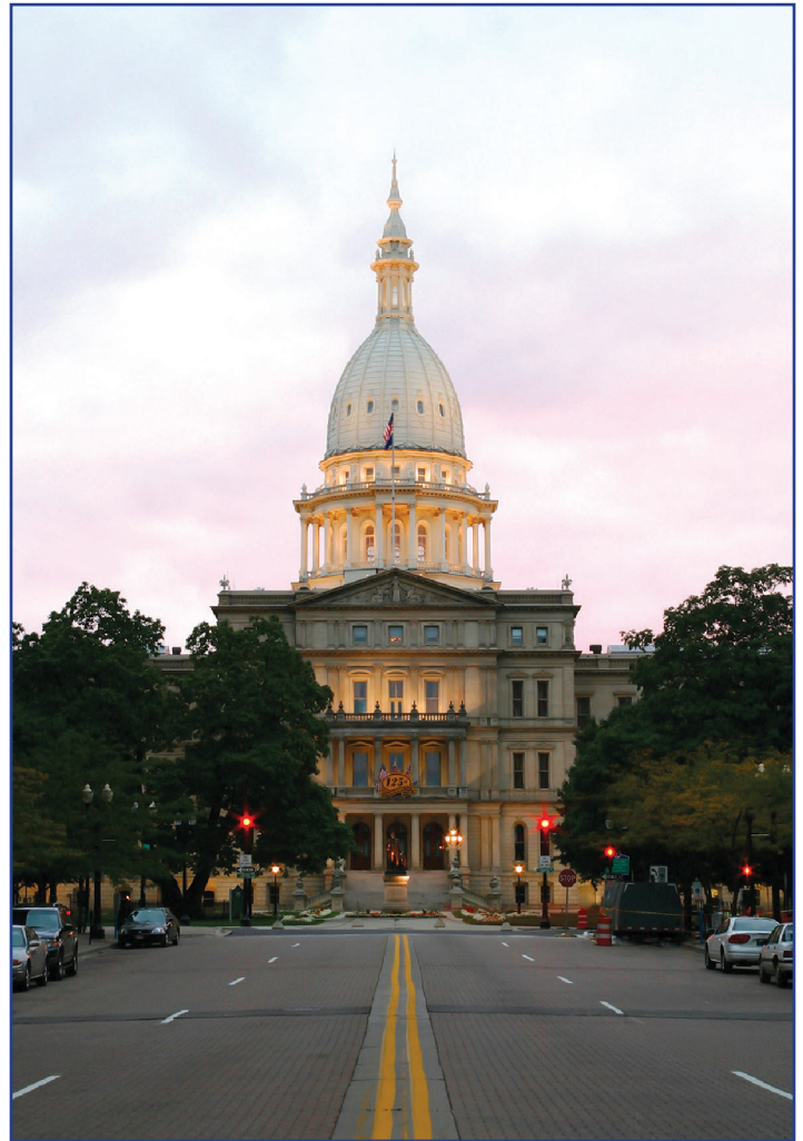
The Michigan State Capitol in Lansing.

For new contamination sites, Michigan should require