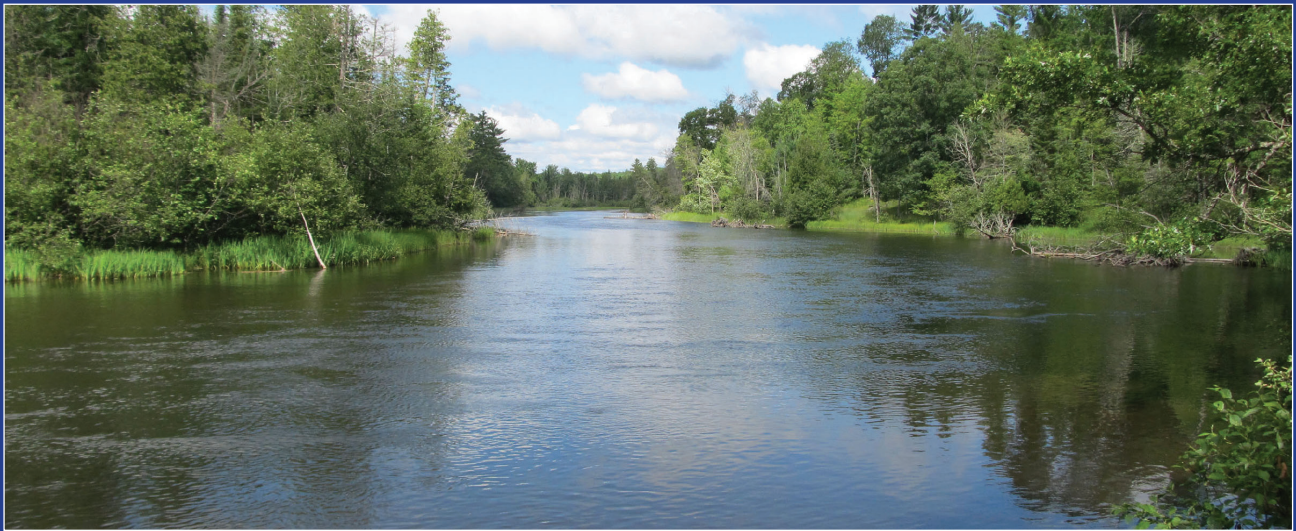
Au Sable River