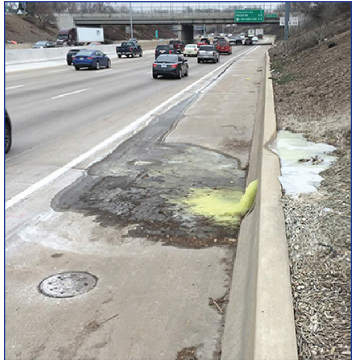
Green ooze that flowed onto the shoulder of I-696 in Madison Heights dramatized the problems associated with leaving contaminants in the ground rather than cleaning them up.

The source of the green ooze, which contained the toxic chemicals hexavalent chromium, trichloroethylene (TCE), cyanide, and perfluorooctanoic substances, or PFAS, was the former Electro-Plating Services business located beside the freeway. Cited in numerous state and federal enforcement actions for sloppy handling of toxic waste, Electro-Plating Services filed for bankrupt-