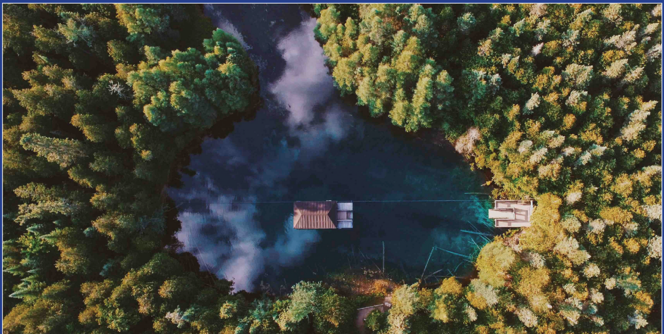
Michigan's largest spring is Kitch-iti-kipi, located in Palms Book State Park near Manistique.

A state sanitary code likely would rely on permitting, inspection, and enforcement by Michigan's 45 local health department jurisdictions. Therefore, the legislation should ensure sustained funding is established that will reimburse local health departments no less than 50% of the cost to administer delegated provisions in a statewide onsite wastewater law and/or resulting code. In addition, the legislation should support the establishment of minimum performance-based treatment standards for the design of onsite septic systems taking into account statewide variability in Michigan's geologic landscape.